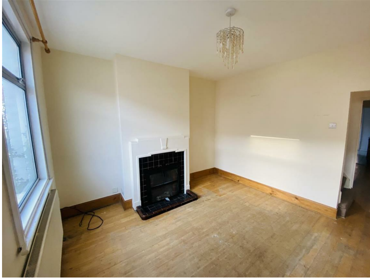
Front aspect double glazed window, radiator, feature fireplace (currently not being used), wood effect flooring.